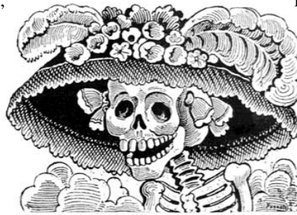
C28 Calavera de la Catrina La Catrina

The Day of the Dead 2008 celebration is sponsored by Living Arts of Tulsa with assistance from the Oklahoma Arts Council and the generous support of local sponsors. This Mexican holiday is dedicated to honoring family and ancestors with food, drink, altars, music, dance, art and much more. For several years now Living Arts has kept this tradition alive with a street festival that honors the cultural aspects of this festive holiday. Authentic Mexican food, margaritas and cervezas will be available.