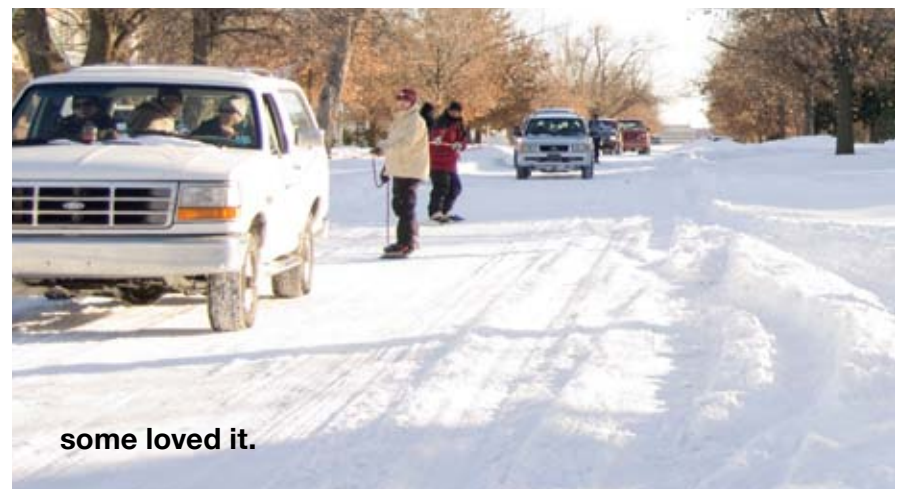
Brady Heights snow