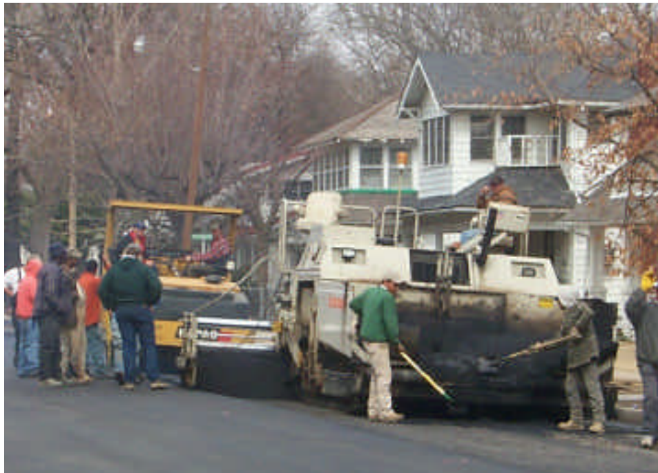
Cheyenne gets paved – bond issue project gives Brady Heights a smooth ride.

The Board has decided to change the Saturday General Membership Meetings from the first Saturday to the second Saturday so that the meeting time will be consistent throughout the year. On holiday weekends, we always shifted the meeting to the second Saturday so now it is easier to remember—the second Saturday of each month. At the April 14 General Membership meeting, we are planning a Spring Celebration and Easter Egg Hunt!