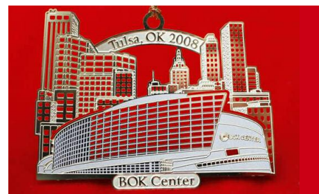
The 2008 ornaments feature the BOK Center with Tulsa's skyline in the background.

These ornaments depict different views of the Tulsa skyline or prominent Downtown buildings. These limited edition ornaments are made exclusively for Downtown Tulsa Unlimited by The Charleston Mint. Each ornament comes numbered with a certificate of authenticity. Ornaments are brass with a 24 karat gold overlay. Ornaments are available year round at Downtown Tulsa Unlimited at 321 South Boston Avenue, Suite 101 and seasonally at Tulsa Treasures at 411 E. 11th Street. Proceeds from the sale of the ornaments benefit Downtown promotions in an effort to make downtown Tulsa a great place to live, work, and play.